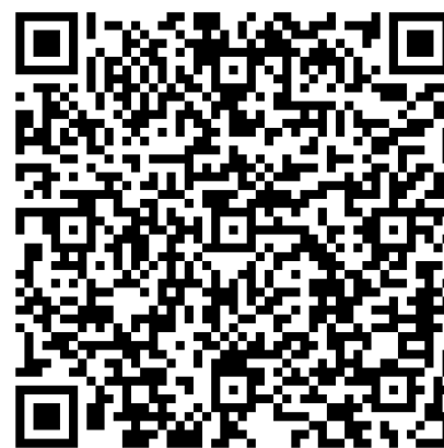
QR Code to the complete document titled “8 Rules for Rockin’ the Tech-Ed.” All websites discussed in the article are present as well as many more.

everyone involved. Technology, whether you love it or are intimidated by it, isn’t going anywhere.