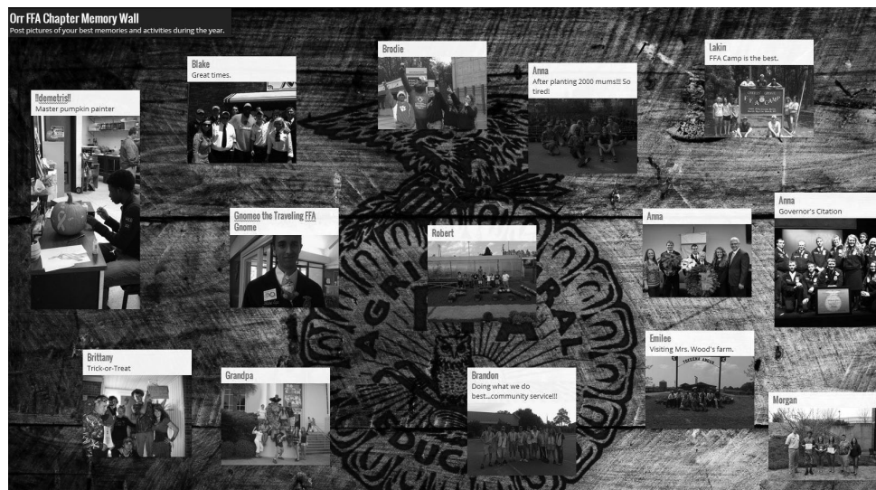
Padlet used for the FFA chapter.

Padlet offers a wide array of options for teachers and students to use for their FFA chapter. Padlet may serve as a type of interactive scrapbook to archive all of your favorite pictures during the school year. I am guilty of not always printing pictures from our events and then would have to search for hours just for one picture. Pictures of student work, projects, activities, memories, and so much more can be shared with