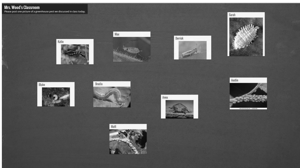
Padlet used in the classroom.

Padlet serves as an interactive classroom tool for students to complete and post assignments through pictures, website links, or comments. Padlet can also be an "exit ticket" or interactive assessment tool to use in your classroom instead of the traditional (yet sometimes boring) pen and paper. Padlet can be used as a tool for students to complete class research projects by posting their content to their own personal Padlet wall and sharing it with you. Additionally, Padlet may be helpful in classroom brainstorming sessions where participation can be active rather than passive for all students. Teachers can use Padlet for K-W-L (what I know, what I want to know, what I learned) charts for pre and post assessment in your classroom. Students can also post questions about specific assignments or topics. Parents can be given access as an easy way to see their