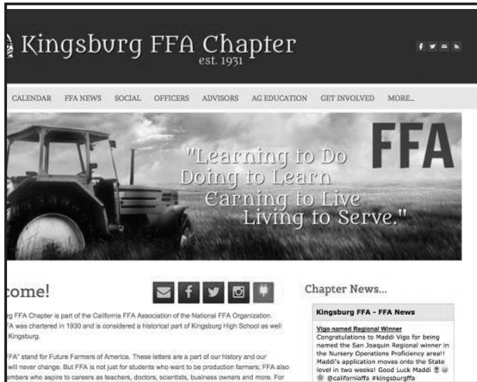
Utilizing Weebly as a Website. Site pictured here is www.kingsburgvikings-ffa.weebly.com

away from the old school leather bound paper portfolio. Adopt an online portfolio and then you can share it with anyone. Your portfolio can be a compilation of lessons, pictures, videos and student projects.